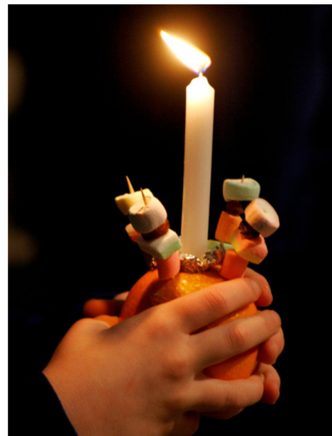
A 'Christingle' orange

Dec 25th (9am) - Christmas Services at Barwon Heads and Ocean Grove Uniting Churches